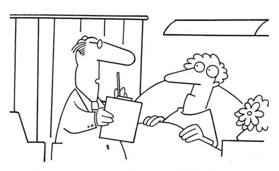
"Your insurance only pays 80% of my fee, so I only took out 80% of your appendix."